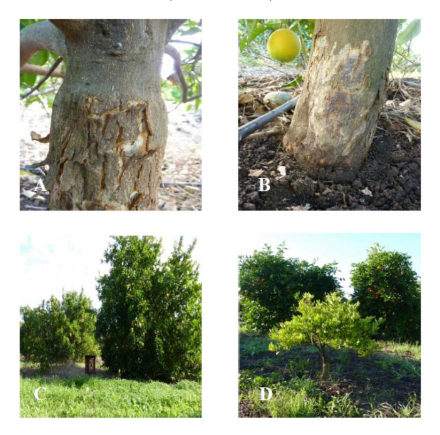
Figure 4: Cintrage troyer rootstock with severe symptoms of flaking (panel A) and redness (panel B) probably due to Citrus exocortis viroid (CEVd)and dwarfism in orange old trees (Panel C and D).

following the traces they leave during the daily activities. The location info are finally shown in the map section where the user can see a map distribution of all provided case studies.