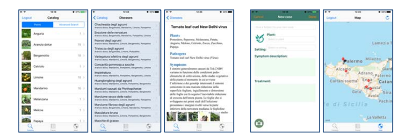
Figure 3: (First three figures from the left) Atlas of plant diseases in the mobile app, (Last two figures from the left) Case studies in the mobile app.

This information is validated and provided by expert pathologists .Furthermore, in the Case studies , the user can see all case studies s/he has sent for consulting, cases ready for send (case studies elaborated but not yet sent) or elaborate a new case study. As you can see in the last two figures of figure 3, in order to submit a new case study, the user has to provide a title , plant name , setting ( Indoor , Landscape , Garden , Greenhose , Farm , Forest ) symptom description, treatment description, case photos (taking photos from 1 to 5). Finally, s/he can decide to send the new case immediately to the expert pathologists or save it for further editing. However, automatically, all the created case studies, are associated with a geographical location (using data from the GPS of mobile devices). In this way it is possible to track plant diseases throughout users' contribute,