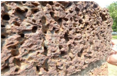
Figure 3: Laterite stone structures of heritage buildings/structure Historical City of Melaka

Laterite stone of Melaka, is a ferruginous deposit of vesicular structure (deposit). This deposit is soft such; it can be cut using a spade, to be made into regular blocks when in freshly state, rapidly hardens and highly resistant to weathering, once it is exposed to the air and sun, subsequently suitable for building purpose. However, beyond the uniqueness, little research has been done for this material particularly on maintenance and repair. Nevertheless, it also demand attention in the Conservation Management Plan for Melaka UNESCO World Heritage Site regarding the appropriate treatment that closely related to materials, methodologies, techniques and workmanship.