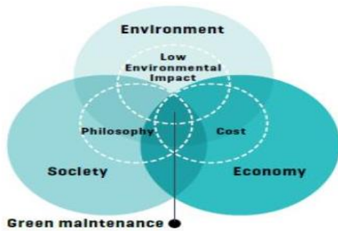
Figure 1: 'Green Maintenance' conceptual model (Forster et al., 2011)

Ideally, heritage buildings can be made to be more sustainable through 'Green Maintenance'. The concept supports the development of knowledge in maintenance practice that needs a pragmatic dispersion towards sustainable which prioritizes the cultural significance not only based on cost and philosophical aspects but low environmental impact. As carbon abatement became a responsibility for each country, therefore, this concept will be positively welcomed.