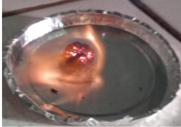
Figure 3: Experiments of pellet's burning with the aid of a blowtorch for visual identification of fouling levels as a function of the content of gypsum waste

Parr® calorimeter was used. Experimental tests of burning and visual detection of residues were performed with the help of a mini blowtorch in a laboratory chapel (Figure 3). For this, the briquettes were placed inside an aluminum capsule and calcined using the blowtorch. Comparative images of the visual aspects of the residues provided qualitative material for comparison between fouling conditions on the walls of the biomass combustion chamber.