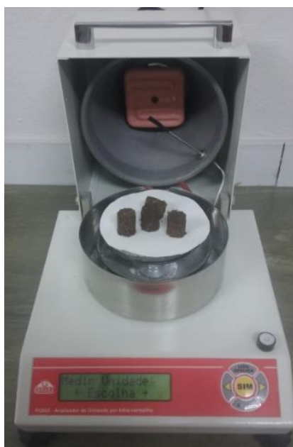
Figure 2: Determination of the pellet's moisture produced from residues of macrophytes and residues of hydrated gypsum

To prepare the pellets, the residue of the macrophytes were dried to a moisture content of 13.0 % wt on a wet basis, determined using a thermobalance (Figure 2). The biomass was weighed and the pellets were made with macrophyte residues and 0.0, 2.0, 4.0, 6.0 and 8.0 % wt gypsum plaster residues. These percentages were calculated as a function of an average value of 1.51 % wt of the calcium content commonly found in floating macrophytes of the Eichhornia crassipes species, according to Tabuti et al. (1998). The strategy to verify the pellet's NCV with about 4 times more gypsum than the one corresponding to the calcium present in the macrophytes biomass was to observe the reduction of the quality of the biofuel with the percentage of gypsum added to the briquettes.