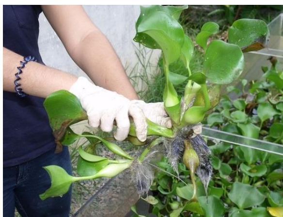
Figure 1: Free-floating water hyacinth Eichhornia crassipes (Mart.) Solms (Pontederiaceae)

The individuals of E. crassipes (Crema et al., 2012) were collected in natural freshwater habitats in Recife city, Pernambuco State, Brazil, where the species are abundant and also have surfactant properties (Brasileiro et al., 2015; Sarubbo et al., 2015) (Figure 1).