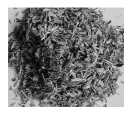
Figure 1: Technical hemp hurds

Technical hemp hurds coming from the Netherlands Company Hempflax (Oude, Pekela, Netherlands) used for this study is shown in Figure 1. This hemp material consisted of a large majority of core fibres (hemp hurds, what is waste of hemp stem processing) over bast fibres, and it also contained fine dust particles originating from the manufacturing grinding process. Original hemp hurds sample had particle length distribution 8–0.063 mm. The mean particle length of used hemp hurds calculated from granulometric data was 0.94 mm. Density of hemp material was 117.5 kg/m<sup>3</sup>. The average moisture content of hemp material samples determined by its weighing before and after material drying for 24 h at 105 °C was found 10.78 wt%. The hemp hurds is constituted by 44.5 % cellulose, 32.8 % hemicelluloses, 21 % lignin, 3.5 % components soluble in toluene-ethanol extract and 3 % ash. The chemical composition of hemp hurds was determined separately for each its component and more described in the literature (Cigasova and Stevulova, 2014).