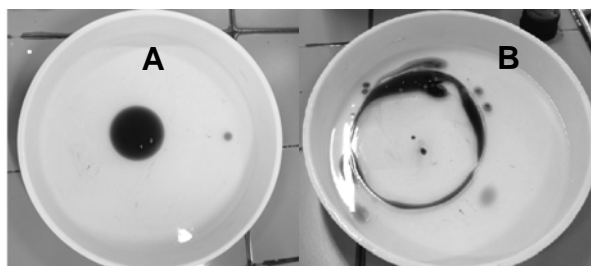
Figure 3: Illustration of motor oil drop before (A) and after (B) dispersion due to the action of biosurfactant produced by C. bombicola grown in distilled water supplemented with 5% corn steep liquor, 5% molasses and 5% soybean waste frying as substrates.

The biosurfactant produced by C. bombicola showed high dispersant activity for the lubricating oil of car engine, which could facilitate the targeting of oily spots in the ocean. The cell-free broth (crude biosurfactant) achieved a dispersion rate of 80 % of the initial diameter of the oil, whereas the dispersion rate obtained with the isolated biosurfactant was 50 %. The results were observed when low amounts of biosurfactant were used, thus demonstrating the potential of these compounds in transporting and solubilizing oil spots on marine aquatic environment (Figure 3).