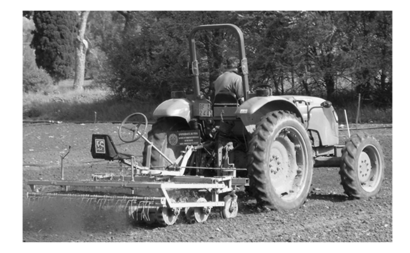
Figure 1: Rolling harrow at work before crop planting

The flaming machines control weeds by the use of an open flame. In these experiments they were equipped with 25 or 50 cm wide rod burners, for a total working width ranging from 1.5 m (in carrot and garlic) and 2 m (in fennel) (Figure 2). This treatment has the advantage of eliminating weeds without stimulating new emergence, because the soil remains undisturbed. The machine is equipped with common 15 kg LPG tanks placed into an on purpose made hopper (Peruzzi et al., 2007). Furthermore, these machines are also equipped with an innovative heat exchange system, in order to avoid thanks cooling during the flaming treatment (due to the LPG passage from liquid into gaseous phase). It consists in heating the water contained into the hopper utilizing the emissions coming from the tractor exhaust head.