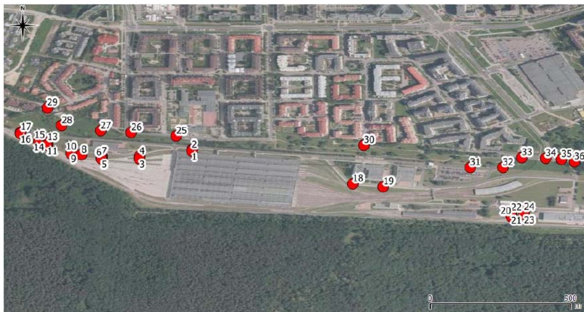
Figure. 3. Location of the points of research on the Technical-and-Parking Metro Station