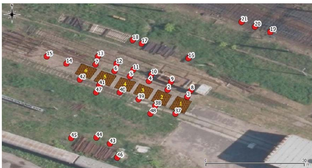
Figure 2. Location of the points of research on the parking PKP station, around wooden sleepers stacks