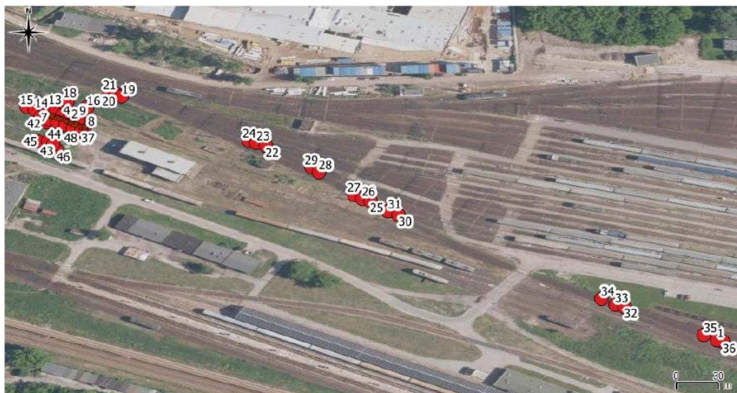
Figure 1. Location of the points of research on the parking PKP station