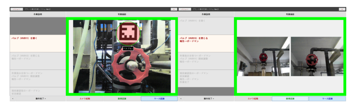
Figure 2. Operation procedures and target device recognition using AR and SURF technology