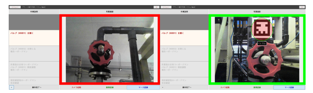
Figure 3. The developed system recognizes the target equipment.

The operating procedure to be used in this system is divided into steps <Step>, the ID information of each device <Target>, name <Name>, and the associated markers <Marker>. By using XML, documentation can be easily created, changed, and appended (Nakai et al., 2013).