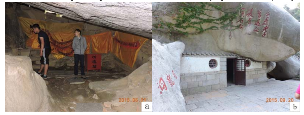
Figure.3. a Mingxia cave in Taiqing palace;

The rolling stone piled cave is also known as rolling stone cave. The granite of Laoshan is situated in a strong physical environment of weathering. Along three groups of joints which are nearly vertical to each other, the rock mass is often cut into many huge cube or cuboid rocks, which keep collapsing and rolling from the cliff under the gravity and become rolling stones broken away from the bed rock. Huge rolling stones can be seen almost everywhere at the slopes and valleys of Laoshan, and their side lengths can reach 5-10m, or even 20-30m. When some rolling stones stack together, the gap left among them might become a "cave"(Figure.2a). This type of caves is the commonest at Laoshan. For example, Mingxia Cave was formed by a huge rock about 20 meters long and three smaller rocks beneath it, which is 3 meters high, 6 meters wide and 10 meters deep (Figure.3a); Youlong Cave was formed by a huge rock and five smaller rocks beneath it(Figure.2b); and Bailong Cave, Mitian Cave and Lianhuan Cave, etc. also belong to this type. This type of caves can also be found at Mount Huangshan, a granite mountain in Anhui Province [Jing (1984) has reported].