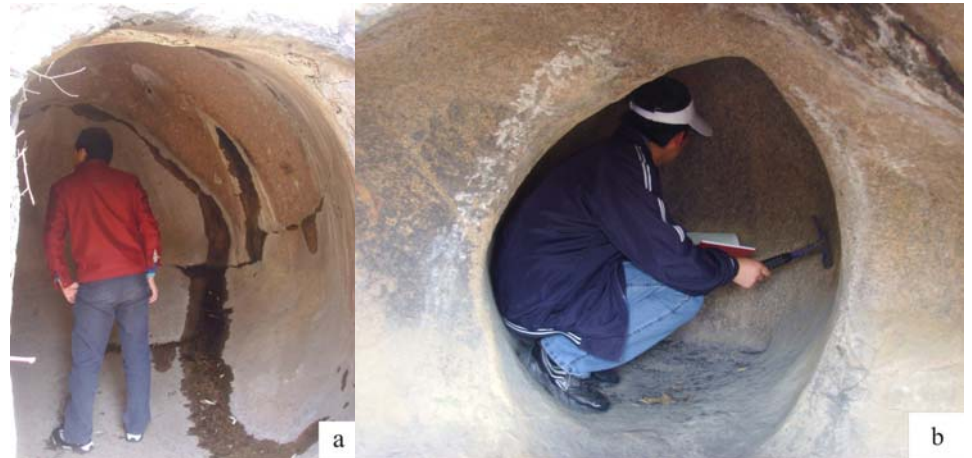
Figure.5 a Yuhuang cave in Hualou; b Huangshi cave in Jufeng

include Huangshi Cave north of Laoshan Reservoir (Figure.5b) etc. These several caves have a diameter of 1-2m.