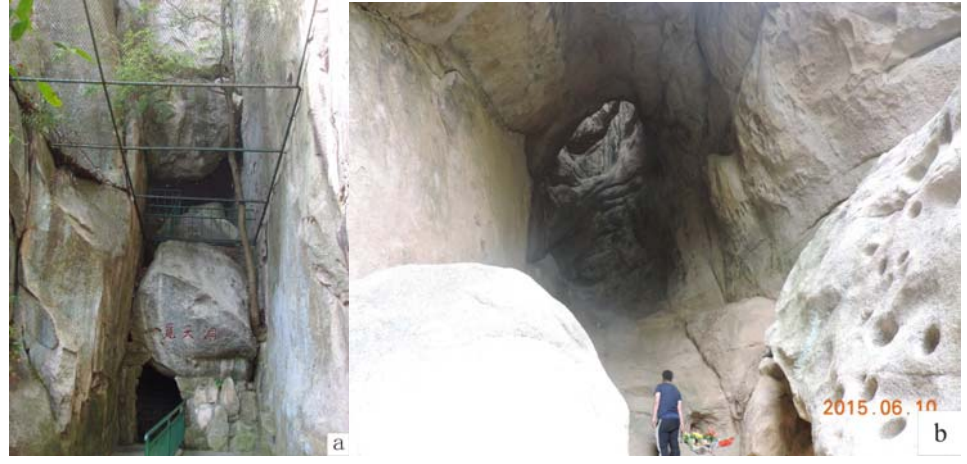
Figure.4. a Mitian cave in Yangkou; b indoor scene of Naluoyan cave

Weathered slipping cave is also called Dismantled Stone Cave, which is a type of prismatic cave embedded into the bed rock on the cliff. Since the fracture joints of granite are cut, in the course of weathering, some stones might slip off the cliff, while the space left will develop into a cave (Figure.2c). The bottom of the stones inclines towards the side of the rock mass high up in the air; under the lubrication of underground water in the melting course, stones will slip off from the rock mass. The major example of this type of caves at Laoshan is Naluoyan Grotto. The cave is 30m high, 10m wide and 36m deep, with an elevation of 340m, where no remains of the ancient coastline have been discovered (Figure.4b). At the top of the cave is a queer small round opening, which is difficult to observe and might be a primary cave (which will be discussed below) that happened to connect with the cave. In fact, the niche-shaped weathered slipping caves are common on cliffs.