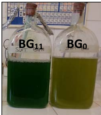
Figure 3: Pictures of Synechocystis sp. PCC6803 cultures in balanced medium (BG 11 ) and in medium lacking added nitrate (BG 0 ). Cultures were grown for 21 days.

Figure 3 shows the pictures of the cultures at day 21. The blue-green cultures typically of the balanced cultures turned into yellow-green for nitrogen-depleted culture. The cell color changed from blue-green to yellow-green because under nitrogen-starvation conditions the phycobiliproteins are degraded. Indeed, phycobiliproteins are nitrogen storage compounds with deep blue color in cyanobacteria (Allen, 1984). The amino acids released by the phycobiliprotein breakdown can be further used to synthesize new cellular materials to sustain cell growth.