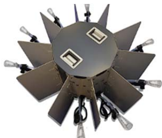
Figure 1: A picture of the eight position dynamic olfactometer ( Wolf)

Figure 1 shows a picture of the new eight position olfactometer, named Wolf.