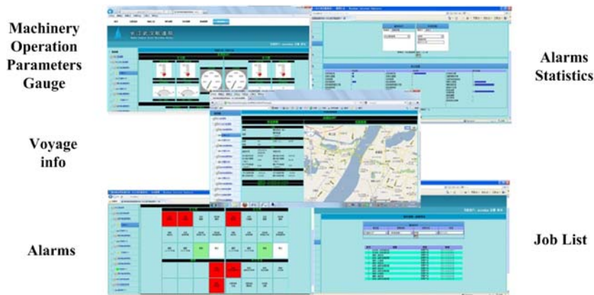
Figure 4 WEB system for fleet management center

The fleet technical management center is for both real-time operation monitoring and historical data statistics, so we provide 2 database for each purpose, one for fast access latest real-time data, one for large volume historical data.