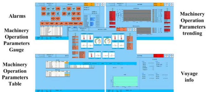
Figure 3 On-board system for alarm, monitoring and data exchange

Figure.3 is the onboard software system we developed for data exchange. This software package can access measurement hardware directly, or get data from alarm and monitoring system, and itself can be an alarm and monitoring system.