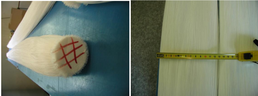
Figure 2: Left figure shows a large ponytail of fibres, right figure shows large PSCs