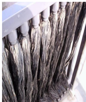
Figure 1: Set of submerged PSC

A series of air bubbles keep all fibres of PSC in a movement. If the source of air has pressure over 3 bars then the PSC are literally whipped and efficiently mechanically cleaned. Defouling and / or antifouling done by whipping have been extensively tested for membrane bioreactors. The operating conditions for PSC and submerged bundles of hollow fibre membranes are very similar if not identical. The key difference is the filtration cake.