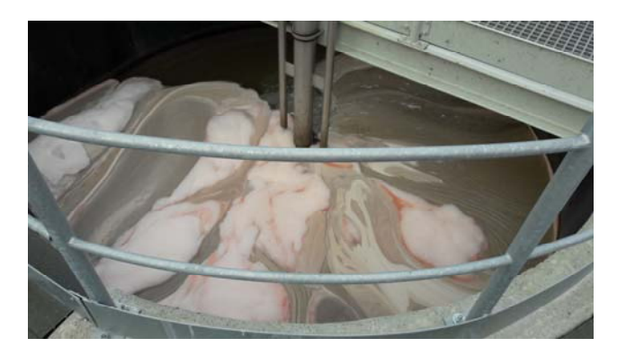
Figure 1: Firefighting foam captured in the wastewater treatment plant

This paper focuses on analysis of firewater runoff in chemical plant classified under the SEVESO Directive III. Lower-tier plant located in the north-east of Czech Republic was selected as a case study area for analysis of different scenarios considering firewater runoff with direct impact to the watercourse. A simple case study is performed, in order to provide the capability of the H&V Index methodology in the firewater runoff risk assessment.