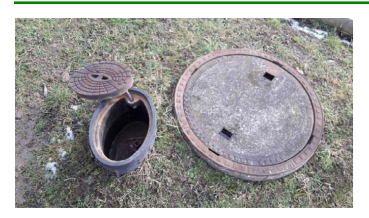
Figure 3: Safety valve for closure of rainwater sewerage system at the outflow to the river