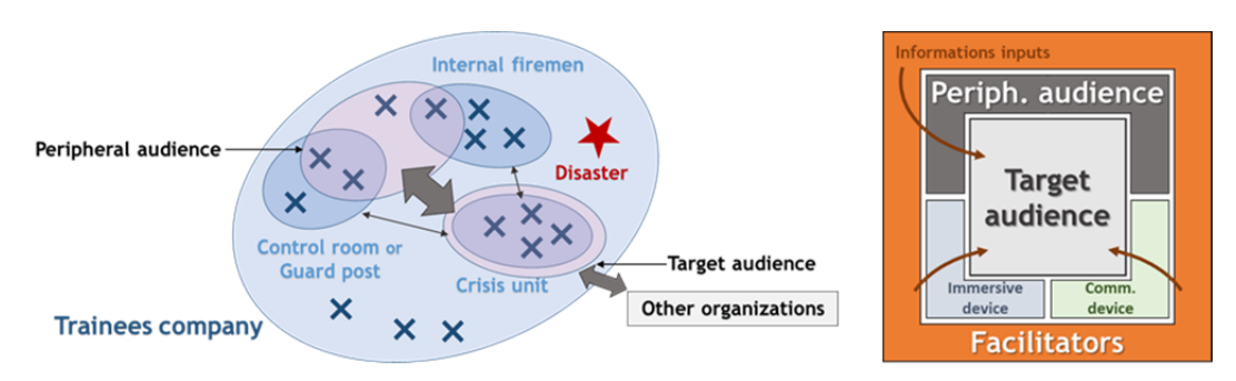
Figure2a: System borders, audiences and other organizations simulation

This step leads to defined, considering the target audience, a second category of audience: the peripheral audience. Those persons are not directly aimed by the training but they play an important role in emergency plan and are direct interlocutors to target audience and have to participate, if possible, to the simulation. Nevertheless, because they are not directly targeted, facilitators mentor them by telling them how to interact with the target audience. Therefore, they can be seen as an input/output interface for facilitation. In the same way, indirect interlocutors such as Medias, political stakeholders, administrative authorities and emergency services are identified according to company's needs and facilitators simulate them during the exercise through phone, mail or other means (Fréalle N. and Tena-Chollet F., 2017). To this end, a sheet showing exercise's phone numbers and corresponding stakeholders is displayed in rooms where target audience is expected to be. Presentation and explanations related to this sheet as well as other immersive device and interfaces should be explained to trainees before the simulation or, if it is not possible, during the exercise by facilitators.