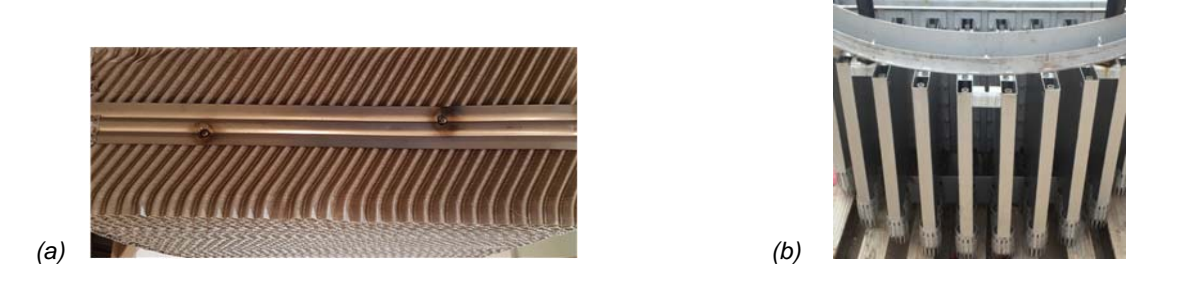
Figure 1 – Photographs of a segment of Montz-Pak A3-500M (a) and the liquid distributor used in this study (b), both courtesy of Dr. T. Cai of FRI

The packing tested was Montz-Pak A3-500M, an advanced version of common type corrugated sheet wire gauze packing, with unperforated surface and a smooth short bend at lower end of corrugations (see photo in Figure 1a). Nominal specific geometric area of this perforated wire gauze packing is 500 \text{ m}^2/\text{m}^3 , however based on measured corrugation dimensions of delivered packing the installed area is 478 \text{ m}^2/\text{m}^3 . The corrugation inclination angle is 60^\circ with respect to horizontal and the void fraction (porosity) of the dry packed bed is around 0.92 \text{ m}^3/\text{m}^3 . Packed bed comprised 13 layers of packing. Each layer consisted of four segments and was rotated by 90^\circ to the previous one, and the total installed bed height was 2.2 m.