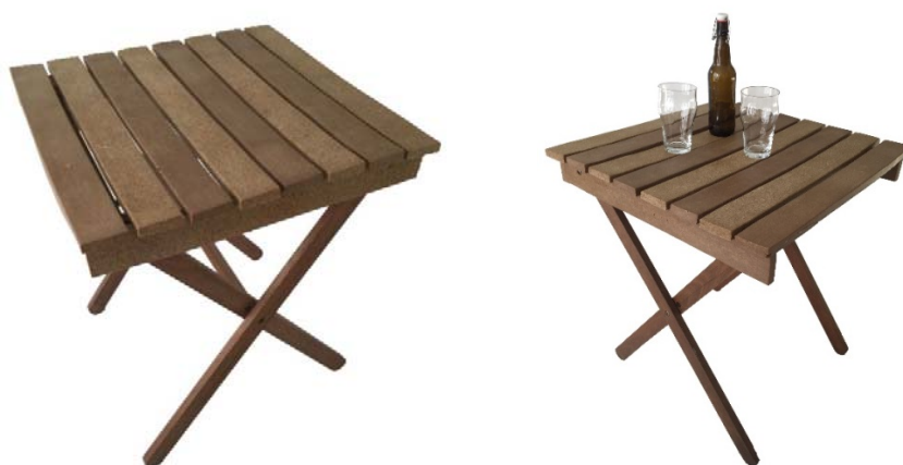
Figure 2. The prototype of the table developed

Figure 2 presents images of the bar table prototype developed with the material that presented the best acceptance. For the construction of the table, it was necessary to use a resistant material, and that had good acceptance of the consumers. Thus, the S6 mixture was chosen, although less resistant than S5, it presented better acceptance and a mechanical resistance equal to the MDF, which is usually used by the industry to produce furniture, in addition to characteristics of resistance and solubility in water much better than MDF.