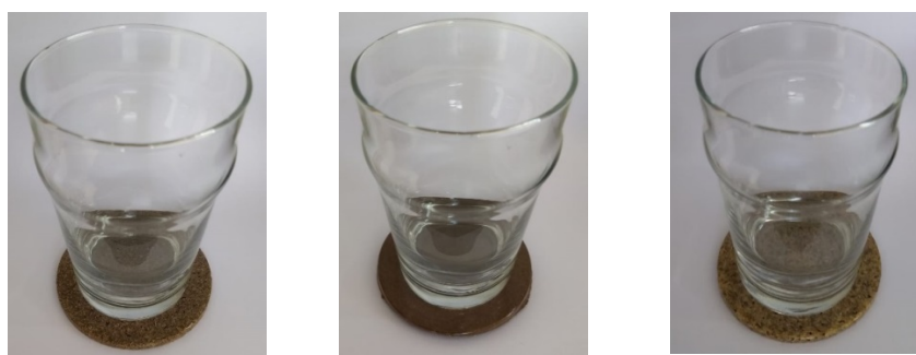
Figure 3. Prototypes of cup holders made with a different mash of milled brewing waste

Since all the composites developed had higher water resistance than MDF, it would be possible to use these materials in products without the use of varnishes or other finishes that need protection against water.