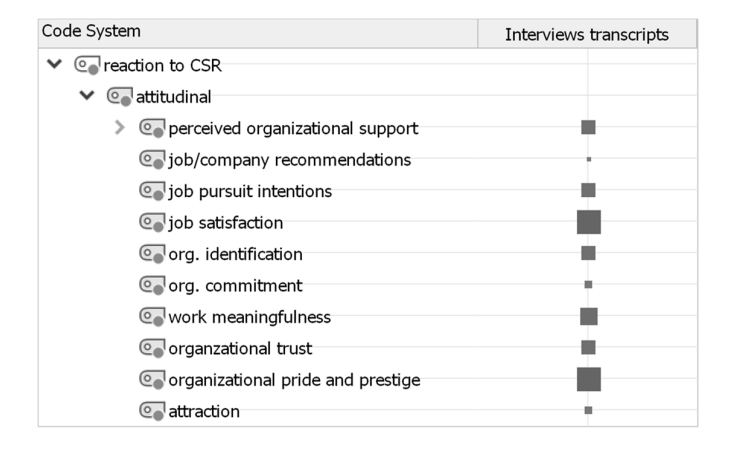
Figure 12. Frequency of the attitudinal reactions to CSR codes across documents

When looking at the sum of the code frequencies across the transcripts (figure 12), it could be observed the most frequent attitudinal reactions to the company's CSR identified in our interviews. The job satisfaction and organizational pride and prestige codes have the highest number of frequencies, followed by the work meaningfulness code. Perceived organizational support, job pursuit intentions, organizational identification, and organizational trust were each identified 7 times. A poor result of only 4 respondents for the attraction code is interesting as it was attributed to those respondents that confirmed that the company's CSR was one of the criteria when deciding whether to join the company. Other participants admitted that they had no information about the company's CSR before joining the company or that it did not play a role when finding this job.