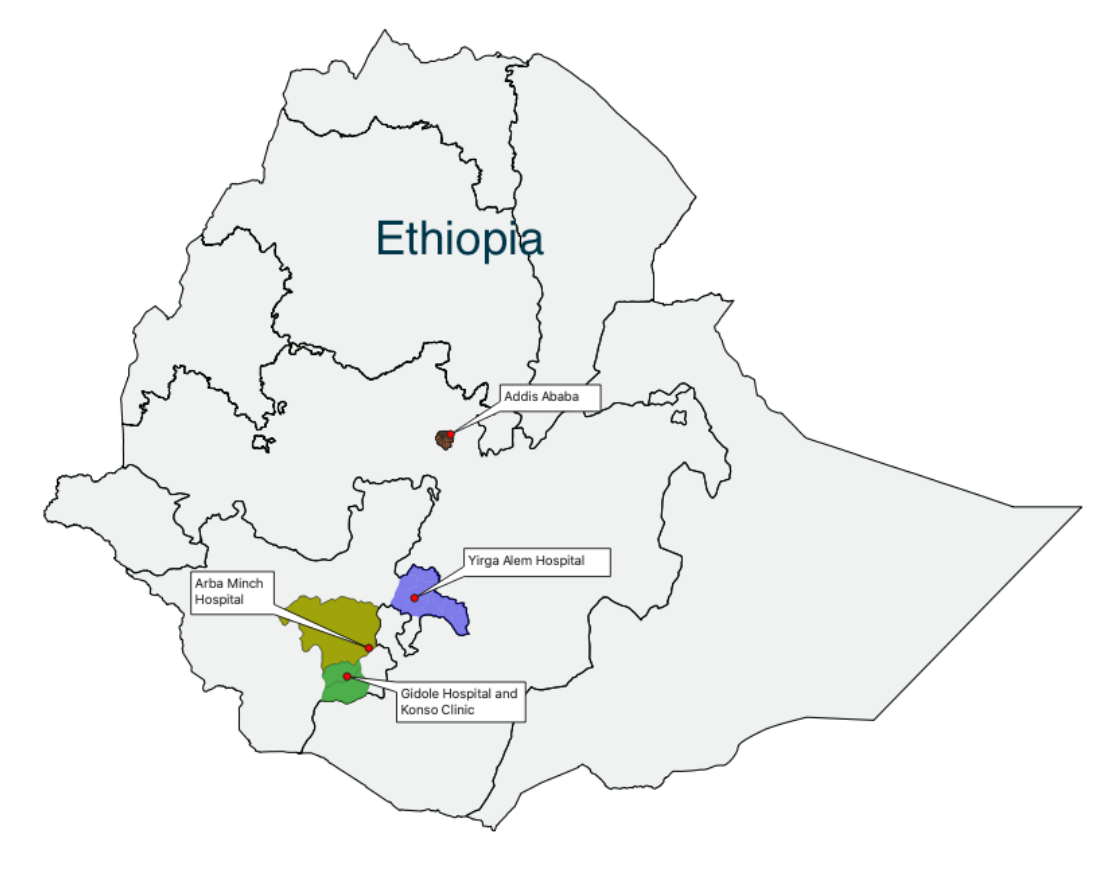
Figure 1. Map of Ethiopia showing the catchment areas of the hospitals included in this study

Since these hospitals were among the few functional health institutions in Southern Ethiopia, patients from almost all of the Southern part of the country came for treatment. The main catchment areas, however, were the sub-provinces depicted as the colored areas in Figure 1. A study done in 1985 revealed that the primary catchment area of a given hospital comprised the population living within a 50-km radius of the institution.<sup>9</sup> The population in the catchment areas was, in the 1980s, about 2.5 million people.