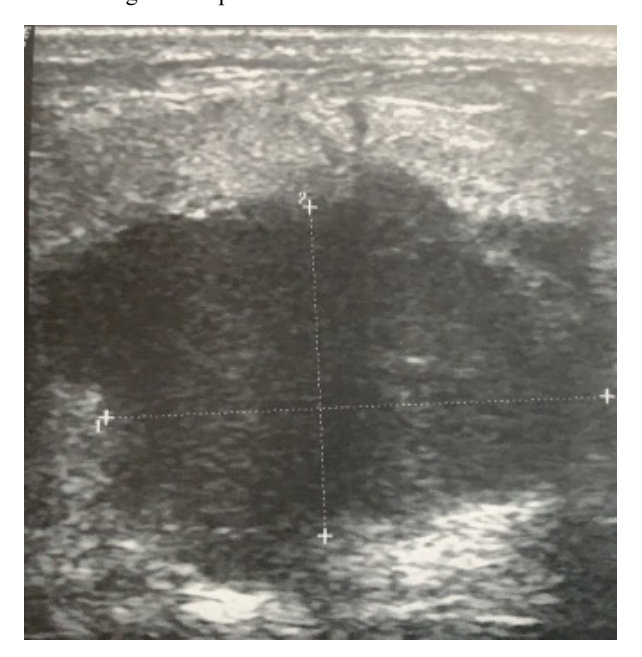
Figure 3. Ultrasonography image of the left breast showing a solid irregular lump

Breast USG showed a solid, irregular lesion without axillary lymphadenopathy (Figure 3). Core biopsy suggested a non-specific chronic inflammatory lesion without evidence of malignancy. A lumpectomy was done but the final histopathology was consistent with invasive carcinoma. She then underwent a modified radical mastectomy, the histopathology reporting invasive ductal carcinoma T2N0 which was triple negative (TNBC) with Ki67 index of 67%. She underwent adjuvant chemotherapy at a tertiary center and was well on follow up.