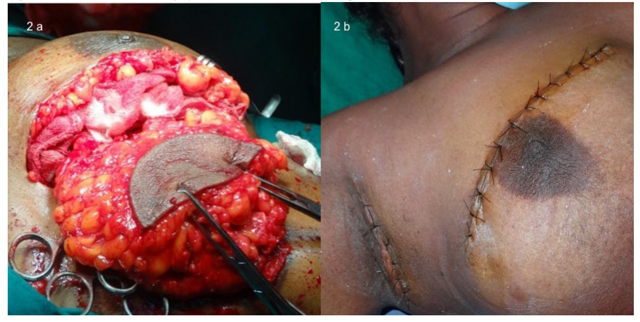
Figure 2. Breast conservation surgery with level 1 and 2 axillary lymphadenectomy

mucinous carcinoma with adequate margins and absent lymph nodal metastasis (T2N0, ER+, PR+, Her2 neu-, Ki67 index 7%). As a radiation therapy facility was not available at our hospital, she completed 25 cycles of radiation therapy at a cancer center and is on regular follow up on hormonal therapy without evidence of disease recurrence after 1 year.