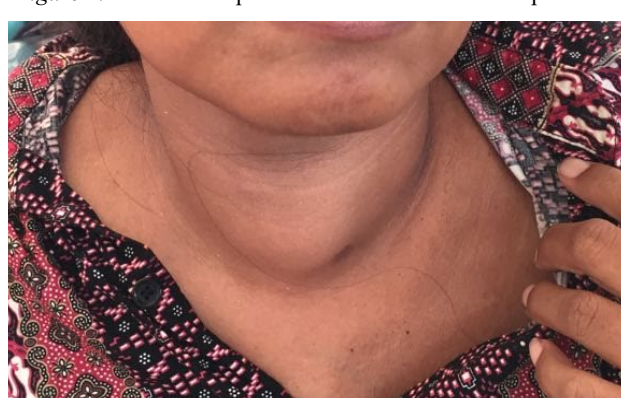
Figure 1. Swollen and painful left side of the neck of patient.

The patient was generally weak, but conscious (GCS 4-5-6), with blood pressure 110/70 mmHg, pulse of 92/minute, respiration rate of 20/minute, and axilla temperature of 38°C. Other physical findings revealed left anterior swelling of neck which was warm and tender, size 4–5 cm, moving up and down when swallowing, and painful (Figure 1).