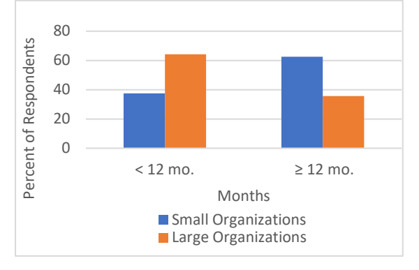
Figure 1 . Length in time in months from community identification for CHE and first CHE home visit

Figure 1 shows a difference in the time between community selection and a community health evangelist visiting homes. Small organizations tend to take longer (greater than 12 months) in developing and organizing the committee before a home is visited whereas larger organizations do this in less than 12 months. The difference in this timeframe could be another factor in overall achievement of transformation outcomes leading to multiplication or related to efficiency factors of organizations working in more communities.