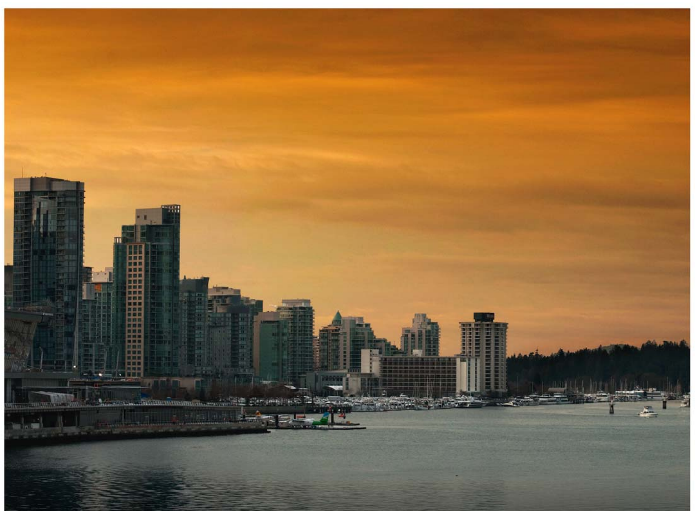
Coal Harbour, Vancouver, Canada