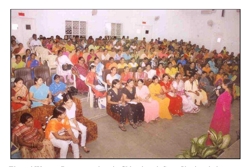
Elected Women Representatives in Chhattisgarh State Sharing their Experiences at the Panchayat Mahila Shakti Abhiyan.

More than half (54%) of all elected representatives were above the poverty line (APL). Little difference was observed between the economic status of male and female elected representatives. However, reservation has been critical to the representation of disadvantaged groups: 88 per cent of elected representatives from those groups were in reserved seats.