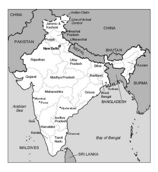
Figure 2. Location Map of Kerala (Wilkinson 2005)

The key function of the Legislative Assembly is to pass laws on those subjects that have been allocated by the Constitution of India. These subjects are mentioned under the State List in the Seventh Schedule of the Constitution. Legislation on the powers and responsibilities of local governments in a State is one of these subjects, and States may enact legislation regarding what local governments can or cannot do. However, the right of local governments to exist as self-governing institutions is one of the principles in the Indian Constitution, drawing on which the national government can also legislate for local government – this was the basis for the 73<sup>rd</sup> and 74<sup>th</sup> Constitutional Amendment Acts of 1992 put forward by national government. This will be examined in detail in a later section.