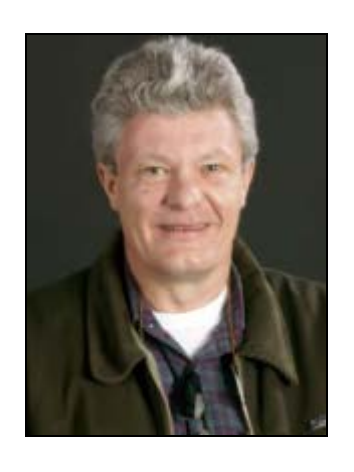
Brian Dollery Centre for Local Government, University of New England Australia

Commonwealth Journal of Local Governance Issue 4: November 2009 http://epress.lib.uts.edu.au/ojs/index.php/cjlg