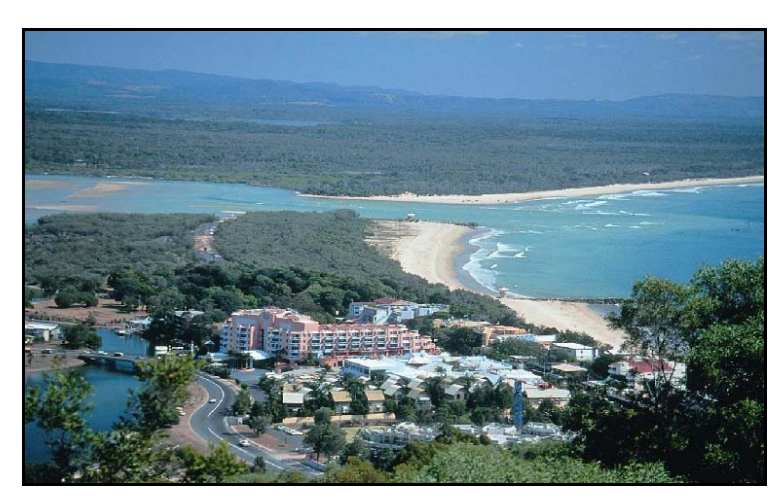
The Sunshine Coast, South East Queensland

has significant capacity for further development and economic growth. There is, however, a lack of essential infrastructure such as roads, drainage, water supply, sewerage treatment, electricity and telecommunications to support future development and the growing population. Alotau is also constrained by the lack of easily developable land due to a number of issues including the township being surrounded by customary land, squatter housing, flood prone areas and general topography.