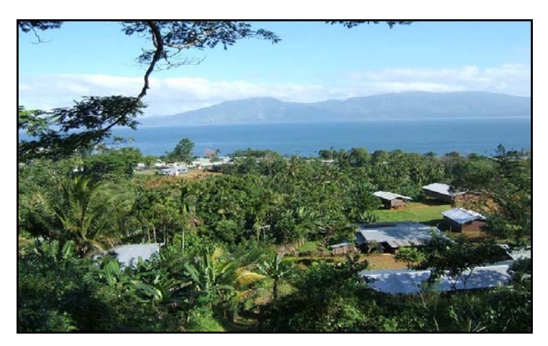
Alotau Town, Papua New Guinea