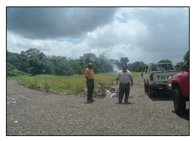
The Mayor and Town Manager inspect the reconstructed road to the dump