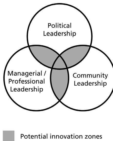
Figure 2. Realms of civic leadership

Innovation does, of course, take place within each of the realms of leadership shown in the diagram. The suggestion being made here is that the areas of overlap tend to be neglected, despite the fact that they can provide exciting opportunities for the development of new approaches to social discovery that, in turn, lead to public service innovation.