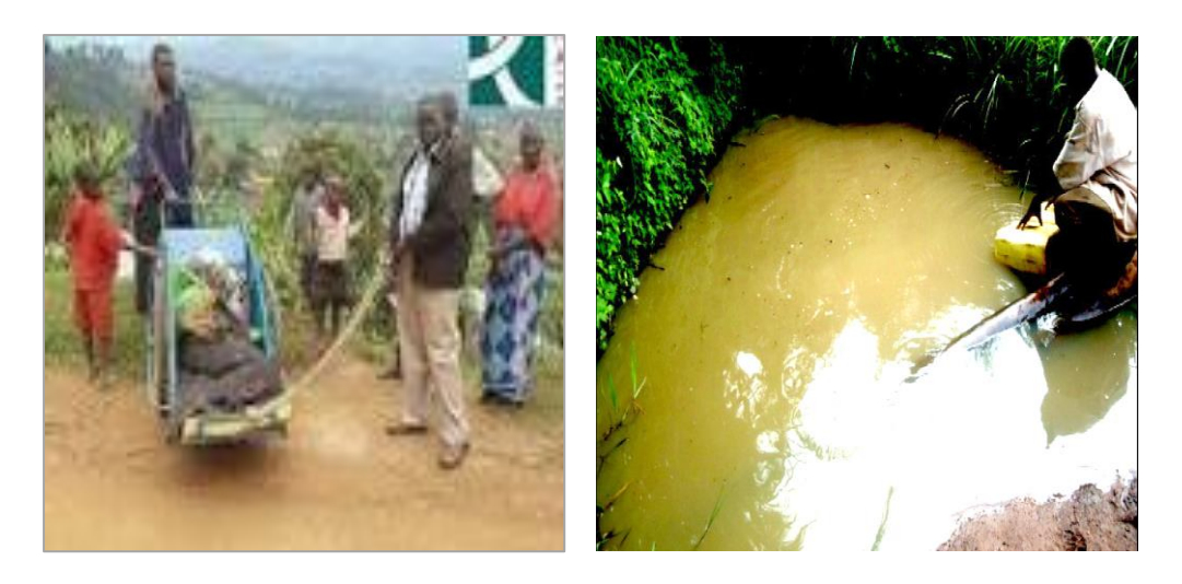
Left: A community "ambulance" (a locally made stretcher) commonly used in some remote places in Uganda to transport patients and pregnant mothers to health facilities.(source: http://wrauganda.blogspot.com/2013/11/unreliable-referral-system-make-poor.html).

The findings in this sector suggest that not every local democracy leads to responsive and accountable actions of the political leaders; and that perhaps a scrutiny of other systemic factors for improved service delivery may override local democracy thinking for improved service delivery. Indeed dilemmas of decentralisation, local democracy, and service in Uganda for over two decades in Uganda can be detected in such illustrations as below: