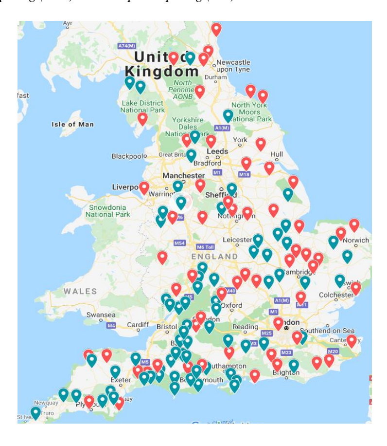
Figure 1: Participating (blue) and non-participating (red) councils