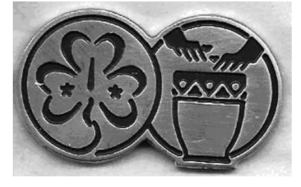
FIGURE 4: THE GGASA'S AFRICAN REGION LOGO

Since the World Association of Girl Guides and Girl Scouts (WAGGGS) was formed in 1928, with South Africa's GGASA a founder member, the WAGGGS member logo is used as the enrolment badge to all new members in the GGASA (GGASA 2004: 9).