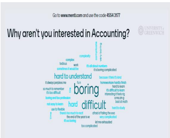
Figure 2: A sample of student responses on Mentimeter