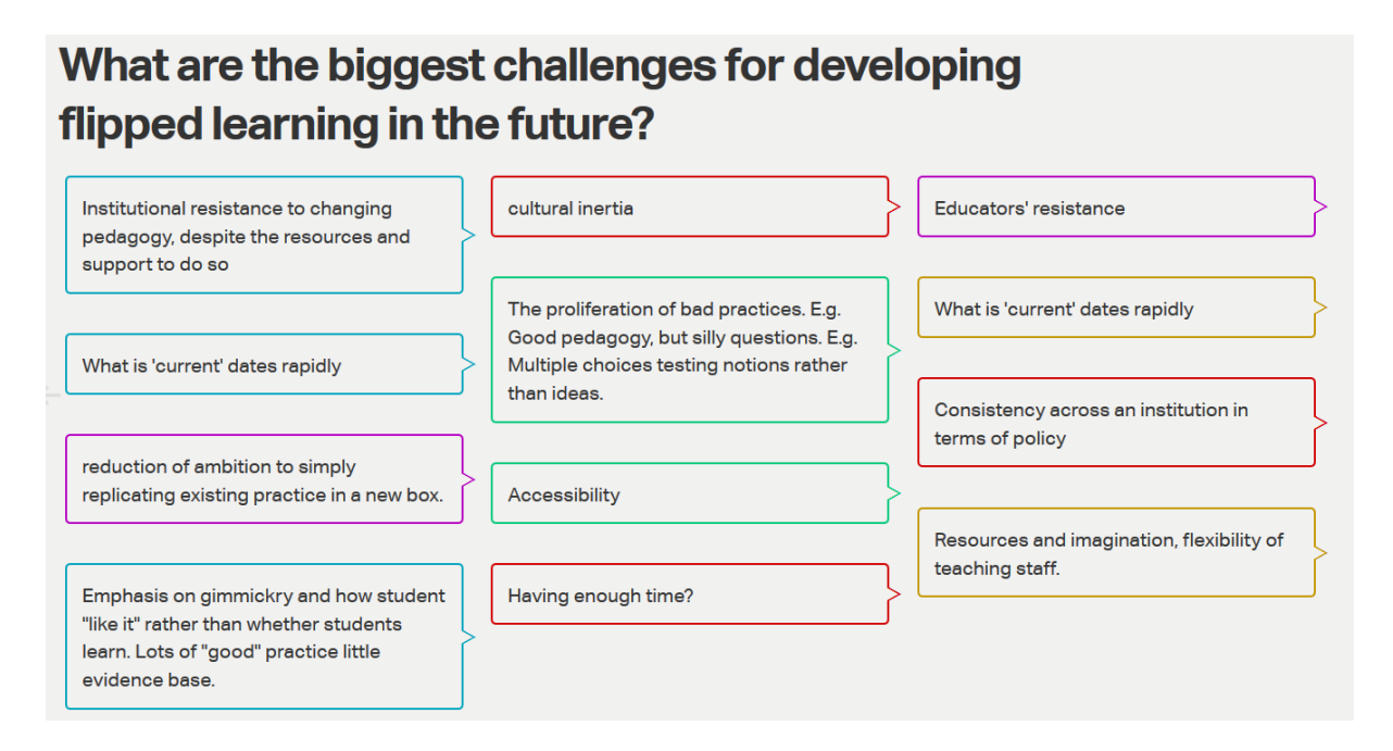
Figure 3: Responses to: "What are the biggest challenges for developing flipped learning in the future?"

The audience responses in Figure 2 suggest opportunities that may be outside the accepted pedagogical benefits of flipped learning (FLIP LEARNING, 2016). Changing the status quo causes inevitable changes to people's roles in learning scenarios, but I had never really thought of existing roles as barriers, considering them to be just a normal feature of the education system of which I have always been a part. However, in changing those roles, students and educators need to evaluate their own knowledge base and how they share and absorb that knowledge, much in the same way as the language and communication evolves. It follows that ownership of learning will be a beneficial by-product of these role reevaluations. By challenging roles, students become more aware of their own learning and I hope that this process will make learners more engaged, more active and ultimately more successful.