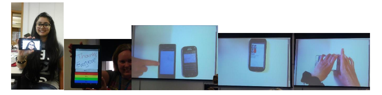
Figure 3: Apps developed at Greenwich

The success of the event at Greenwich was evident from both the formal and informal responses we got on the day and after the event; for example, the participant who developed the app for skaters remarked in an email after the event: