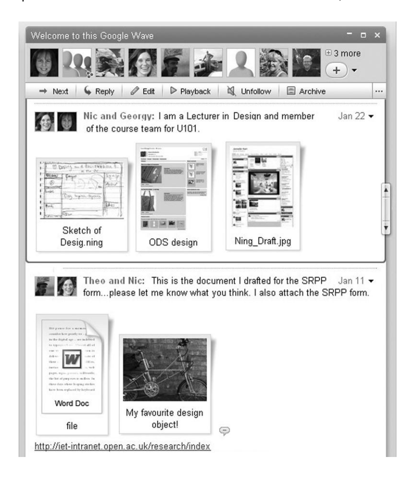
Figure 4 Screenshot of a Google Wave for tutors

There are over 50 tutors (associate lecturers) involved in the tutoring of students across the three design courses, coordinated through 13 regional Open University offi ces around the UK. Although some associate lectures meet occasionally to run day schools they have limited opportunity to communicate across the programme and rely on the course tutor forums or private emails for communication. This study began with the intention to create opportunities for the sharing of knowledge and resources to take place within a virtual environment, through the use of Google Wave, a content sharing tool. Google Wave was chosen as it provides a private space for members to communicate and to share documents, as shown in Figure 4.