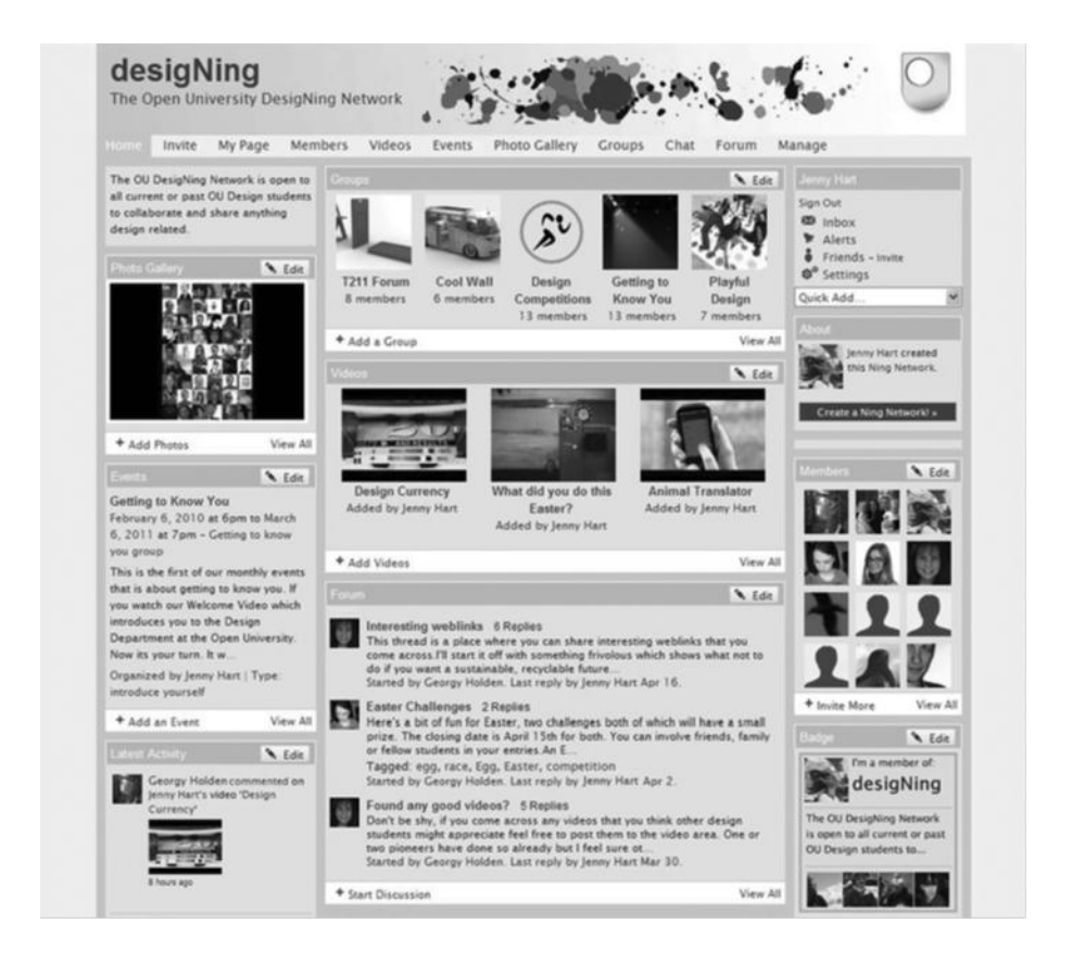
Figure 2 The Open University desigNing network

the website enabled the creation of a more personalised private space dedicated to the design community within the Open University. A screenshot is shown in Figure 2. The desigNing website was created in February 2010 and now has over 150 members across all three course programmes. The site provides three main functions. First it acts as a living repository of design resources based around videos, pictures and web-links uploaded by its members. Second, the uploaded artefacts (pictures, videos, links etc) provide the basis for communication within the network and third, the site provides a space for both synchronous and asynchronous events to take place, for example collaborative games, competitions and live events.