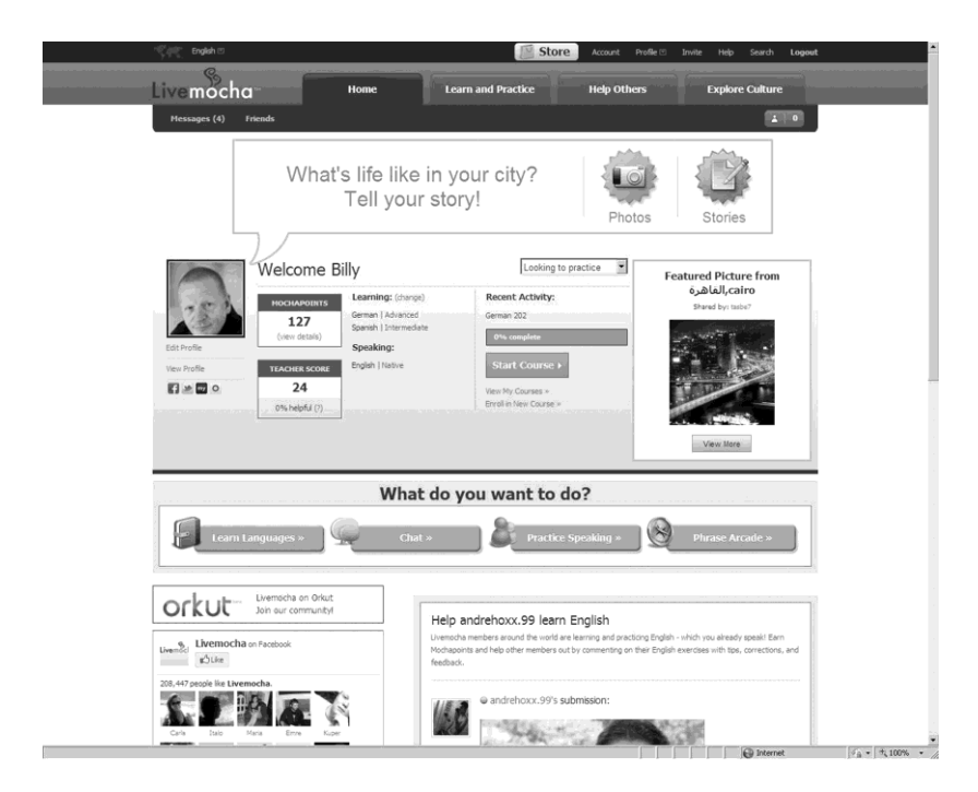
Figure 1 Home screen

In the learn section (Figure 2), learners are able to view the courses they are currently taking, create flashcards based on what they have learnt and further sections to view work submitted for review and for further practice. There are seven activities: