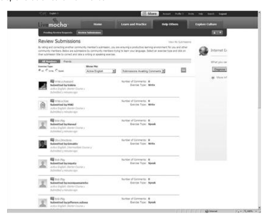
Figure 3 Share screen

the other hand, the feedback can be almost instantaneous and from multiple sources which allows users slowly develop a reliable network of 'friends'.