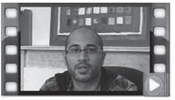
Importance of presentation skills