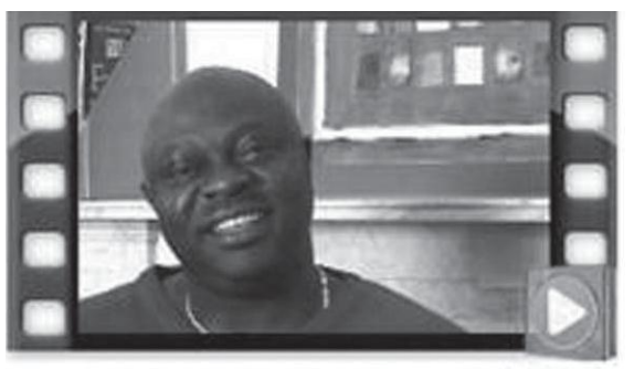
Experiences from study skills workshops in the library