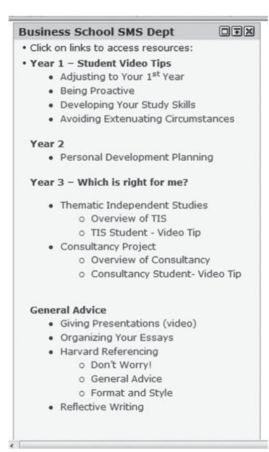
Figure 2 E-transition portal channel

At the beginning of the term, students have to choose between two Year 3 capstone courses – Consultancy and Thematic Independent Studies. However, written information sent by the Business School office often did not provide students with a 'real sense' of the actual course expectations and requirements. LOs, in the form of (1) audio-narrated presentations by both course leaders and (2) student video tips/advice about both courses, were made available and enabled students to make 'more informed' choices based on previous students' real experiences. See the topic Year 3 – Which is right for me? shown in Figure 2.