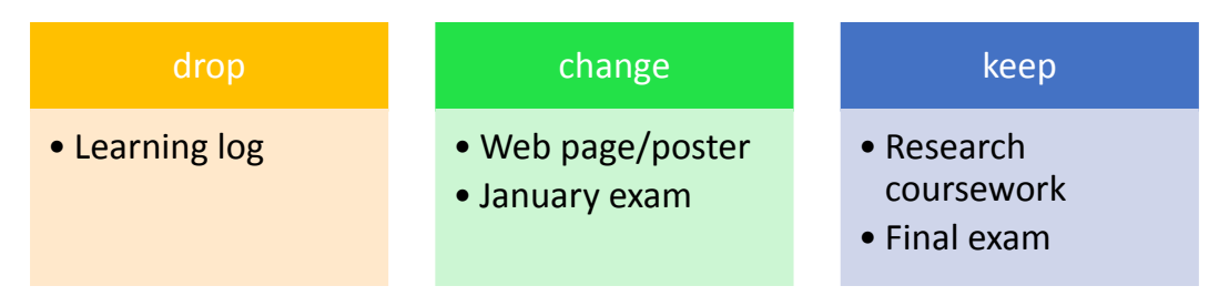
Figure 3: Change decisions

Decisions made fell broadly into three categories: