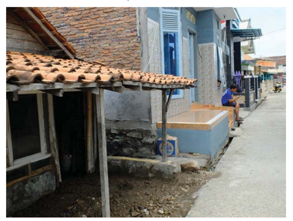
Fig. 4: The difference between the heightened house and the "sinking" house is evident, the community road has been renewed

Source: Morodemak in Demak, neighboring Semarang, photo by F. Hillmann