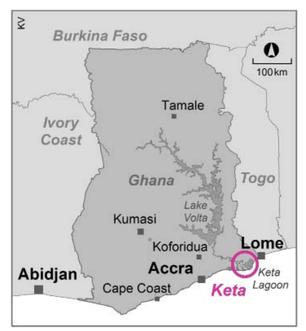
Fig. 1: The Location of the case-study, Keta (Ghana)