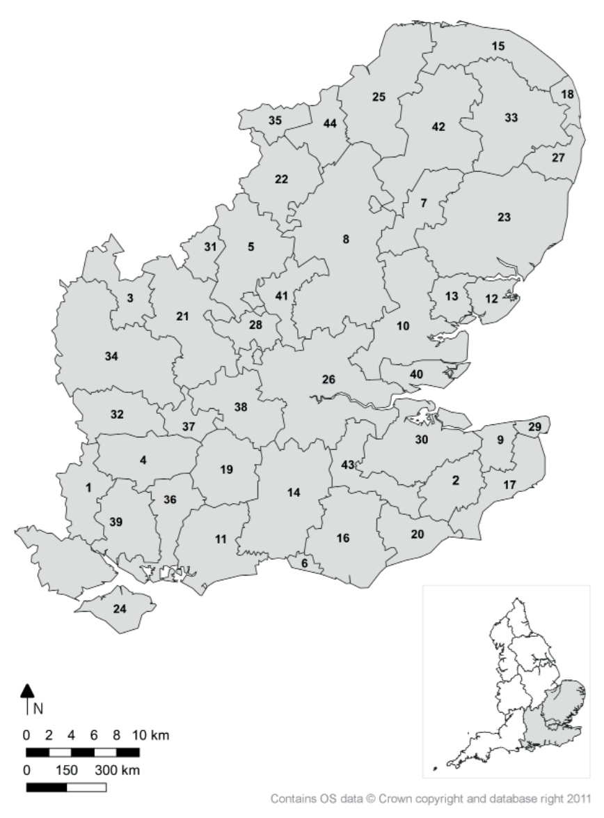
Fig. 3: The WSE's TTWA geography

Note: The areas displayed here constitute the best fit of local government areas to the detailed geography of the ONS's 2011 TTWAs, see text. The name of each TTWA can be found from the first column of Table 2.