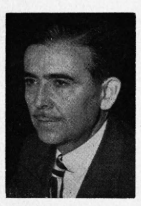
L. Quincy Mumford

This is a unique occasion in the history of librarianship in the United States when an