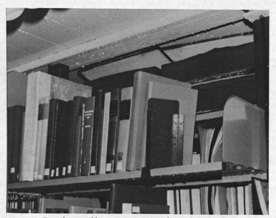
Even after several hours water continues to drip on the books below.

The risk manager's advice was clear: prudent action must be taken in order to minimize loss even though liability, costs, financing, or other factors were not re-