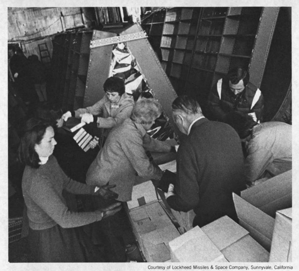
Loading the vacuum chamber with frozen books.

were so encouraging, we knew for the first time that we could save most of the books.