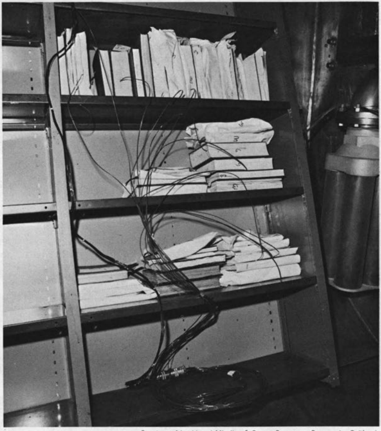
Pretest in vacuum chamber illustrating shelving and wrapping experiments.

cruited truck drivers from among the staff.