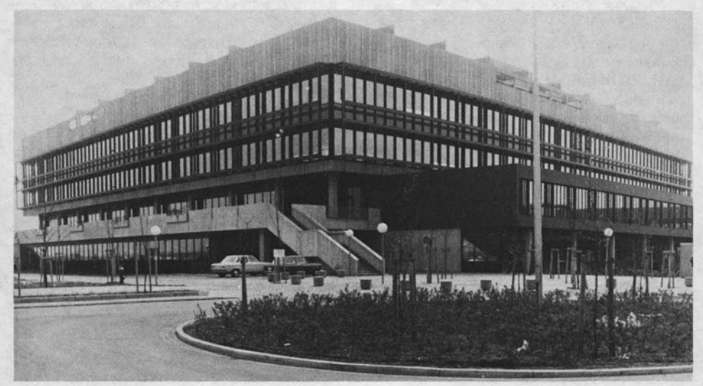
University of Bremen library: view from the north, showing entrance for personnel and delivery section for suppliers.

Early in the planning phase it was decided that there should be on this new campus a library system with a relatively large central library and only five departmental libraries