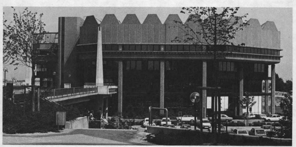
Library, University of Dortmund.

On the first floor, which because of a mezzanine is in part two-storied high, there is near the main entrance a tiered floor audito-