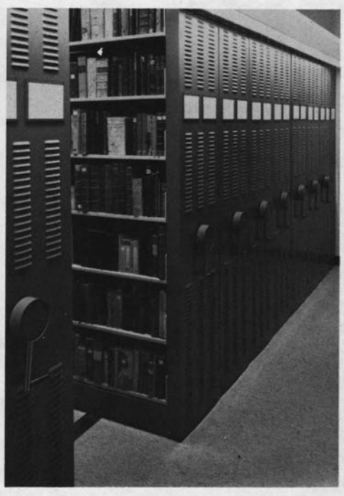
Housing rare books in the law library of a major university, RHC-Spacemaster movable compact shelving provides twice as much capacity as conventional shelving would have provided in the same space. The mechanically-assisted operating system is shown.