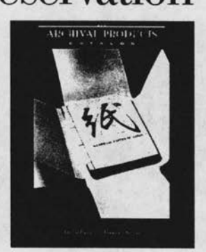
for a complete catalog