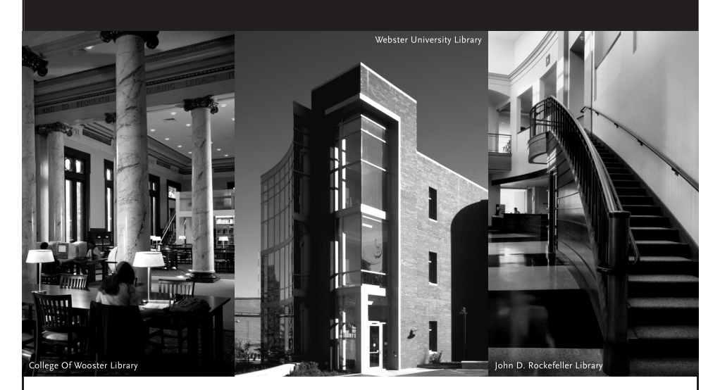
Designers for Libraries & Academic Institutions

177 milk street boston massachusetts 02109 t 617 423 0100 f 617 426 2274 w perrydean.com