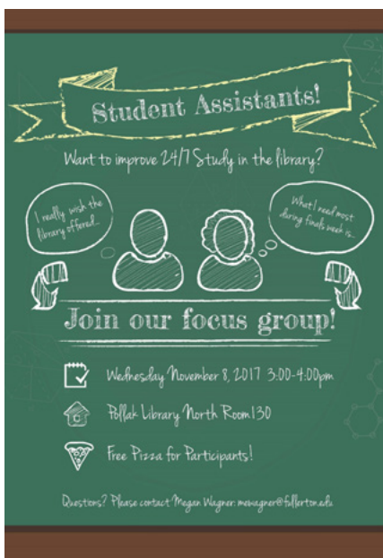
Focus group recruitment flyer.