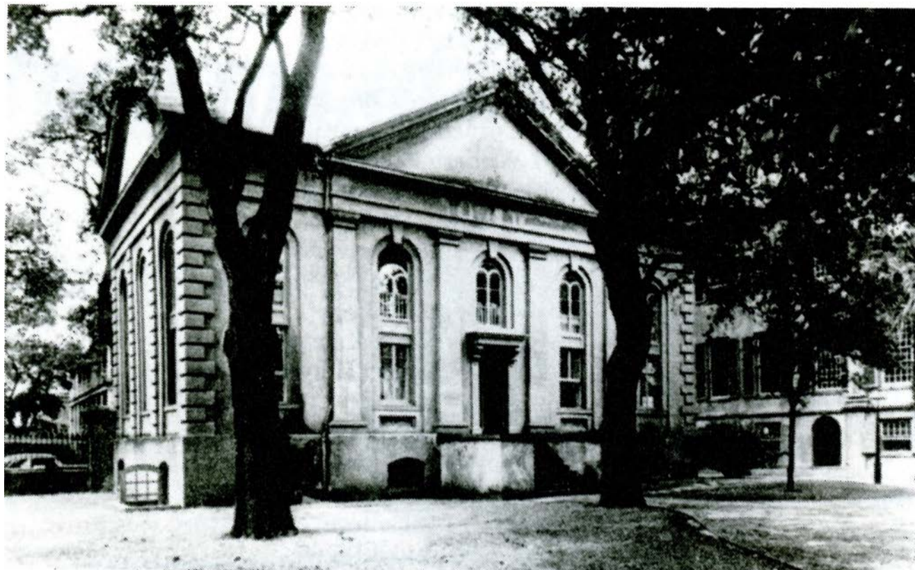
Left: College of Charleston Library, Charleston, S.C., 1856.