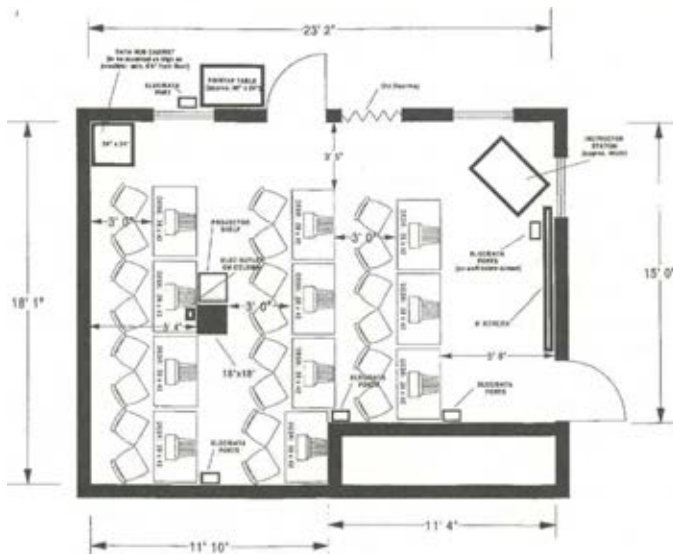
Floor plans of the Moore Library Lab/Training Center

Along the way, recommendations by the Facilities Staff were made for desk design improvements, inexpensive soundproofing, inexpensive air-handling improvements, lighting