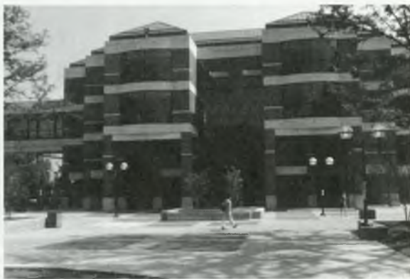
The newly renovated Shapiro Undergraduate Library at the University of Michigan, Ann Arbor.